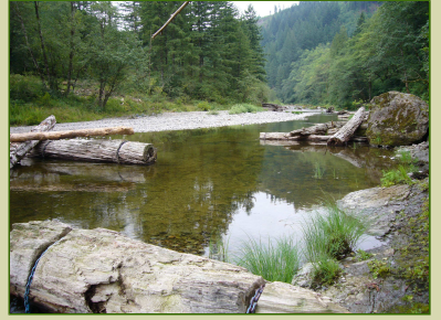
See our Featured Projects